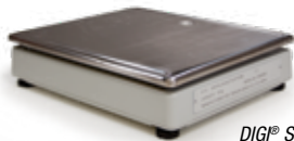
DIG® Scale Base