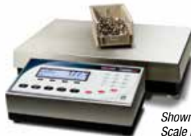
Shown with BenchMark® Scale Base and Bracket